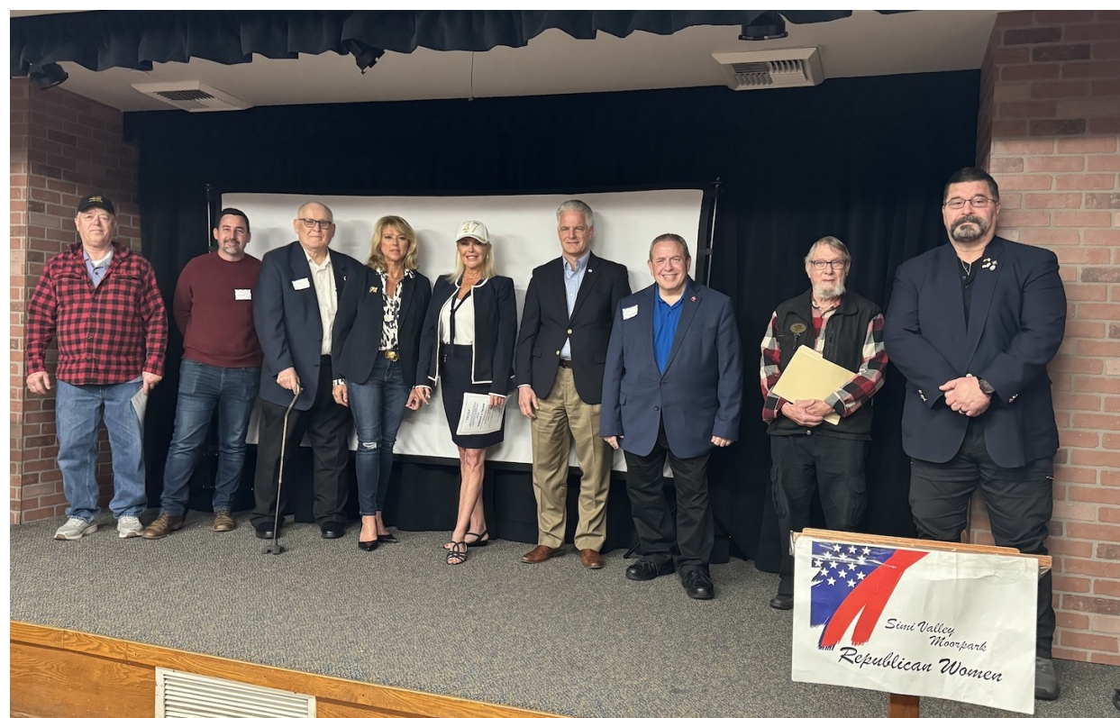
Candidates for Ventura County Central Committee

Note for Members: Everyone is encouraged to call or send emails to your local legislators. Scroll all the way to the bottom to capture your District representatives' information.